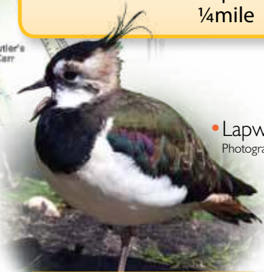
• Lapwing Photograph © Nick Ford